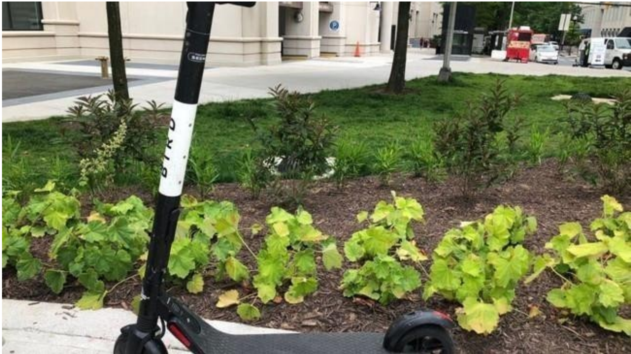
A Bird e-scooter in Arlington.

RELATED: Why Arlington County leaders are creating clearer rules for electric scooters