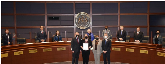
May as Teacher Appreciation Month