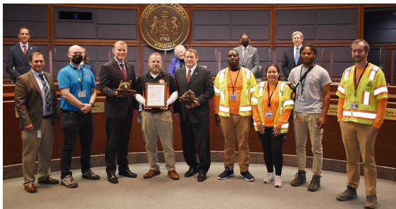
May as Fight the Bite Awareness Month