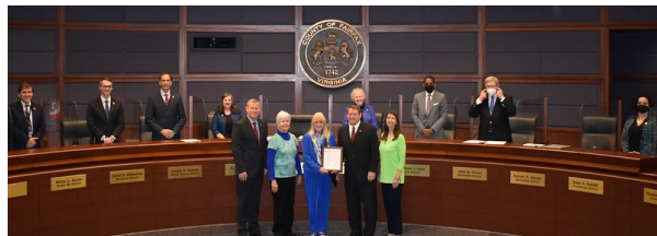
May as Lyme Disease Awareness Month