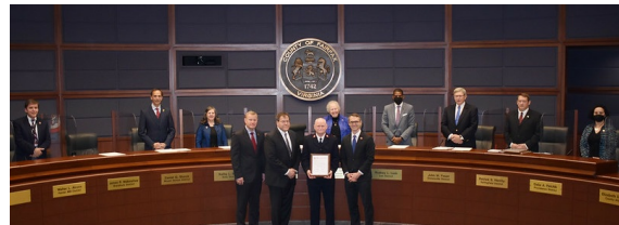
May 9 - 15 as National Salvation Army Week