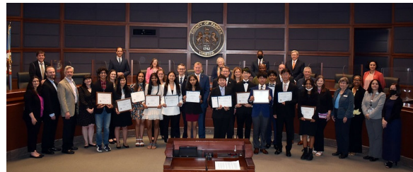
Student Winners of 2021-22 Shark Tank Technology Challenge