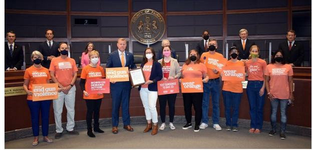
June 3 as Gun Violence Awareness Day