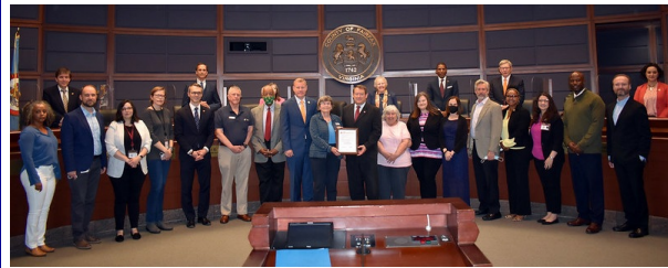
May as Older Americans Month