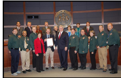
October 2018 as Cyber Security Month

To view the October 16, 2018 Board Package click here .