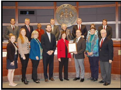
October 27, 2018 as VolunteerFest Day