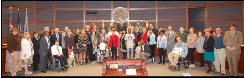
October 2018 as Disability Employment Awareness Month