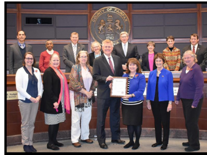
Recognized the 100th Anniversary of the end of World War I

To view the October 30, 2018 Board Package click here .