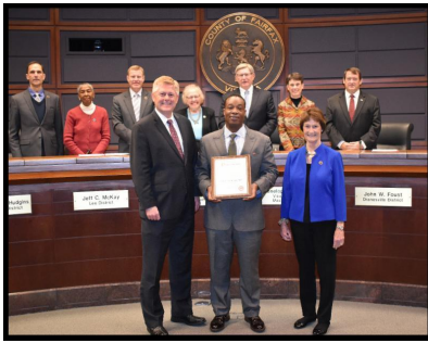
Proclaimed November 2018 as American Indian Heritage Month