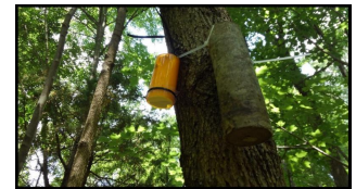
Emerald ash borer parasitoids released in County

Emerald ash borer (EAB) is an introduced invasive insect that has wiped out ash trees in more than 30 states including Virginia where there are unlikely to be many remaining, healthy ash trees. When an ash tree is attacked by EAB, it will almost certainly die if nothing is done to protect it.