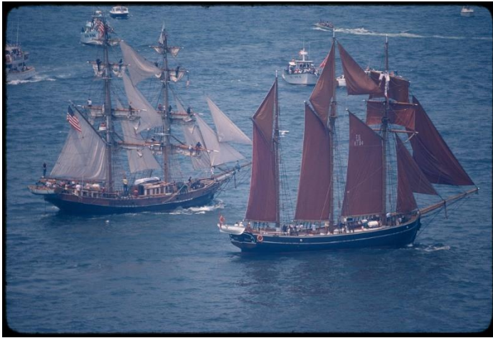
Tall ships during the Bicentennial in New York City.

Work at the national level continues beyond the efforts of the U.S. Semiquincentennial Commission and America 250. In August 2021, 21 federal agencies signed an interagency memorandum of understanding with American 250 that commits them to planning, creating, and collaborating on 250th anniversary programming. For 2024, the National Park Service (NPS) has dedicated funds for “diverse programming that promotes shared stories and experiences and strengthens common bonds . . . leading up to July 4, 2026.” NPS also offers preservation-based support through its Semiquincentennial Grants Program, begun last year, for “restoring and preserving State owned sites and structures listed on the National Register of Historic Places that commemorate the founding of the nation.”