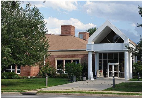
Sherwood Regional Library