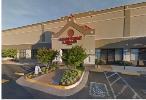
Kingstowne Regional Library