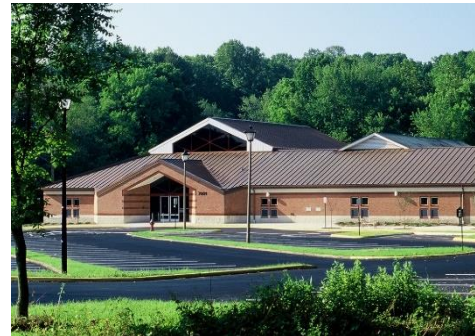
George Mason Regional Library