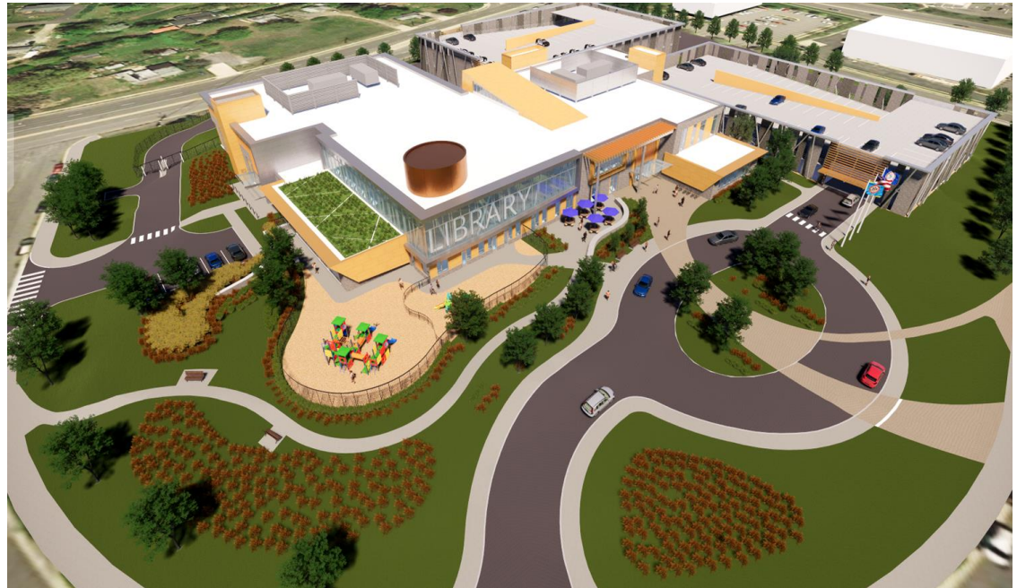
Public Entrance Elevation from Silver Lake Blvd.