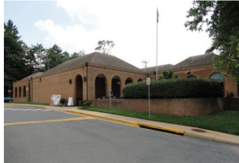
Patrick Henry Community Library