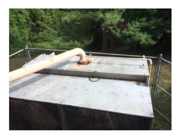
HVAC systems nearing end of service life