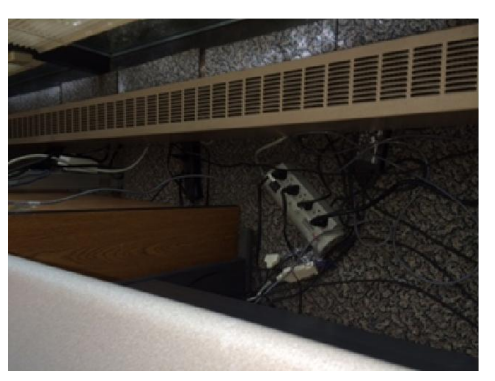
Customer requests for additional outlets