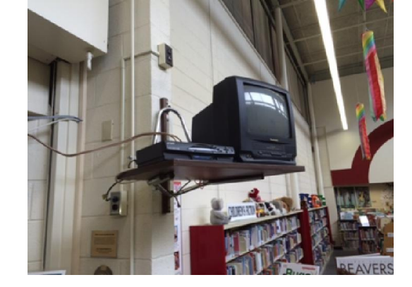
Dated technology cords strung to plugs