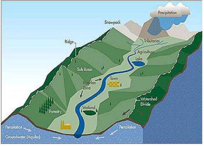
Figure 1.1 Diagram of a watershed

The boundary of a watershed is defined by the watershed divide, which is the ridge of highest elevation surrounding a given stream or network of streams. A drop of rainwater falling outside of this boundary will enter a different watershed and will flow to a different body of water.