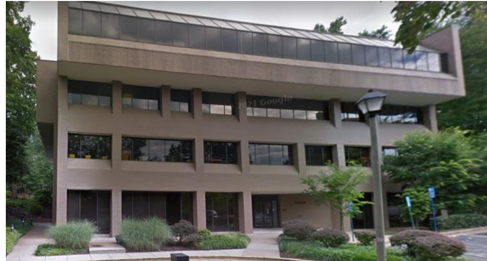
Lake Anne 11484 Washington Plaza West