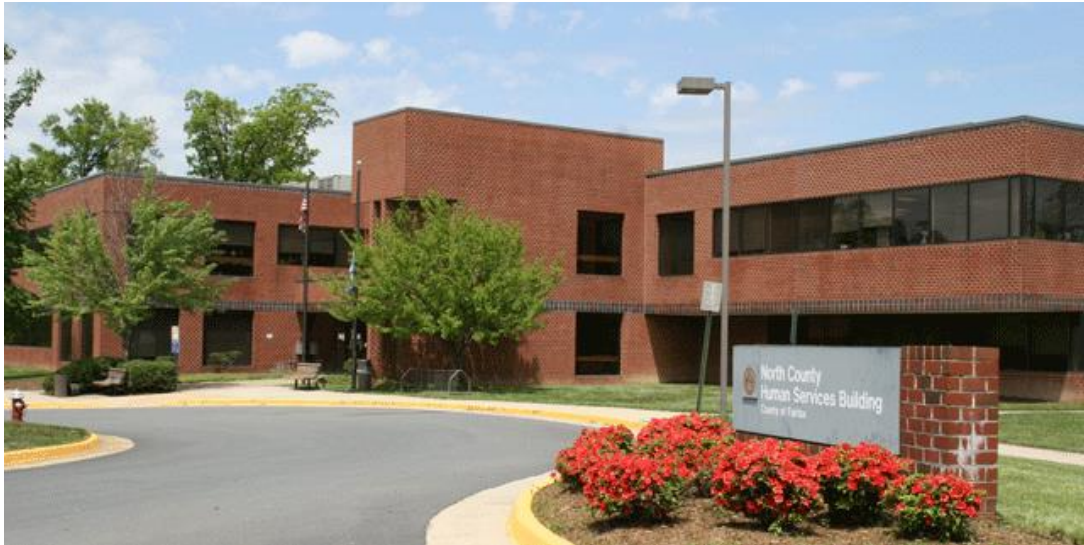
North County Human Services Center 1850 Cameron Glen Drive