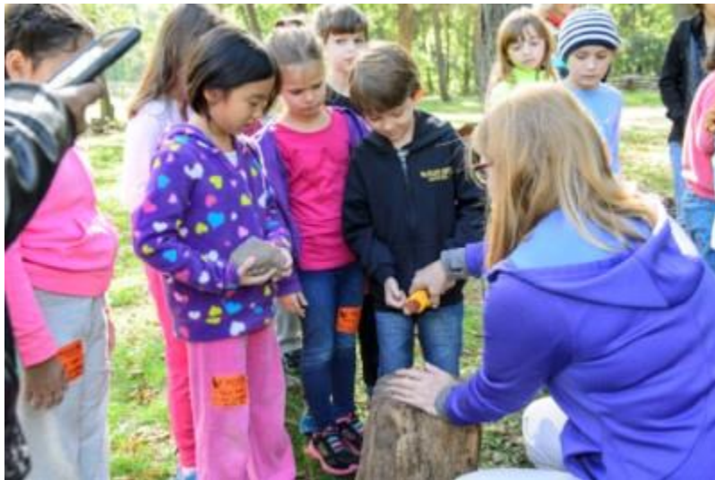
Program Leader at E.C. Lawrence Park