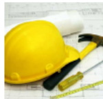
Board of Building & Fire Prevention Code Appeals (professional experience required)