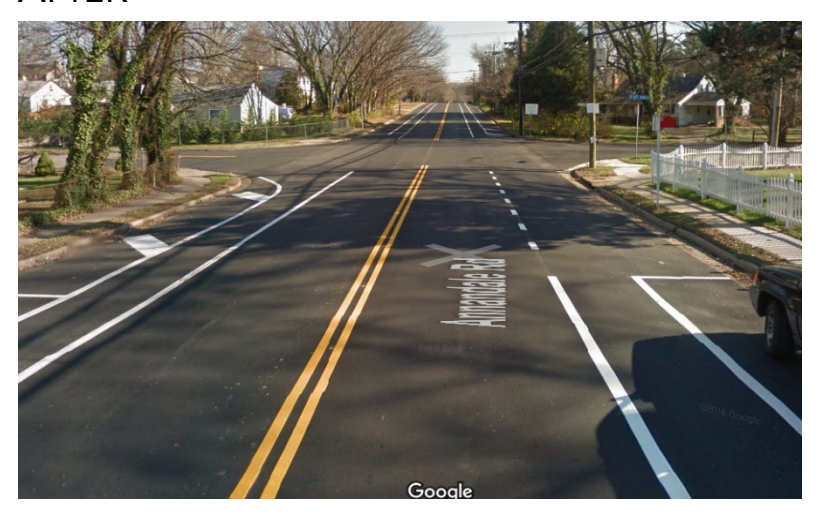
Top speeds virtually eliminated