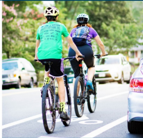
STANDARD BIKE LANE

Motorists may legally cross the double yellow line in order to safely pass a person riding a bicycle, as long as the oncoming lane is clear.