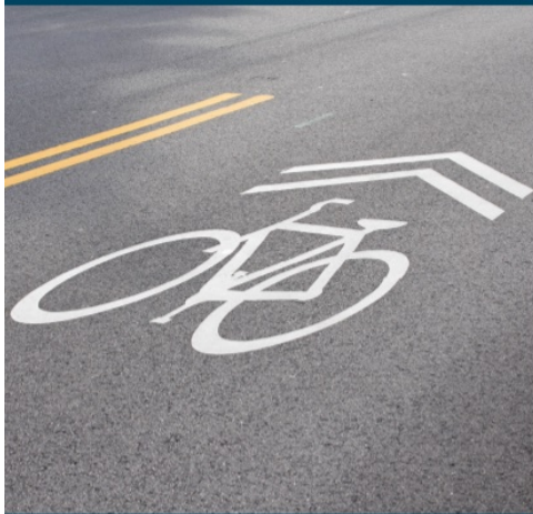
SHARED LANE MARKING (SHARROW)

Shared lane markings indicate a shared travel lane for bicycles and cars.