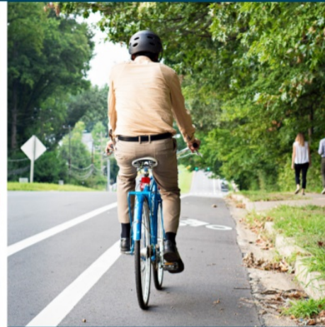
BUFFERED BIKE LANE

Bike lanes give bicycles and cars their own spaces, making it safer to pass legally.