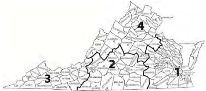
VDGIF Administrative Regions